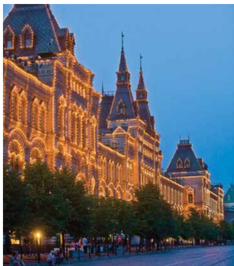
GUM department store, Moscow