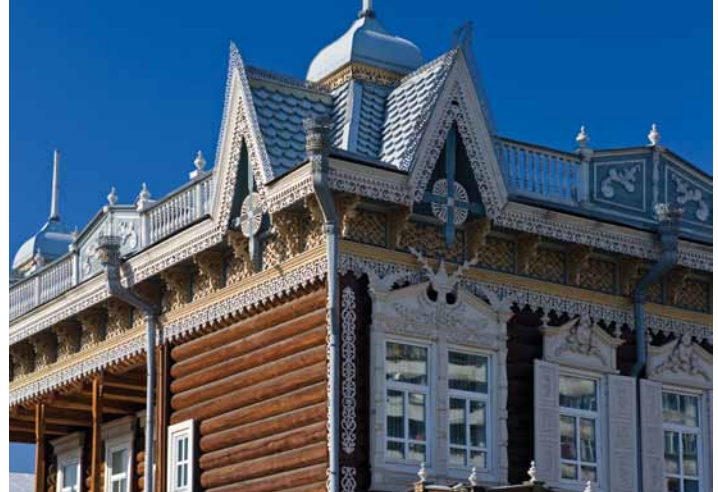
Classic wooden architecture, Irkutsk

There is also the Freedom of Choice option to visit a local family living in a Soviet-era apartment building, who will serve you tea and traditional Russian snacks and will be happy to answer your questions about life in modern-day Russia.