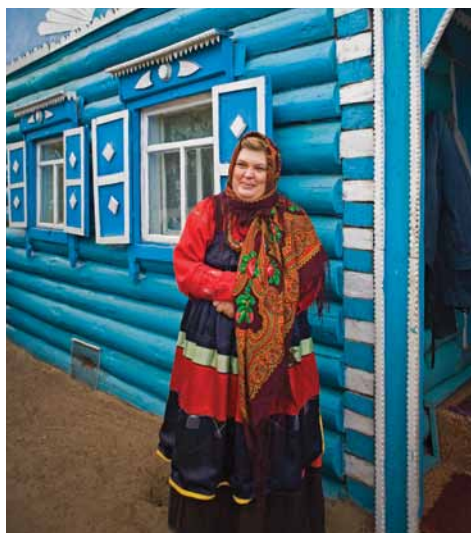
Old Believers Village, Ulan Ude