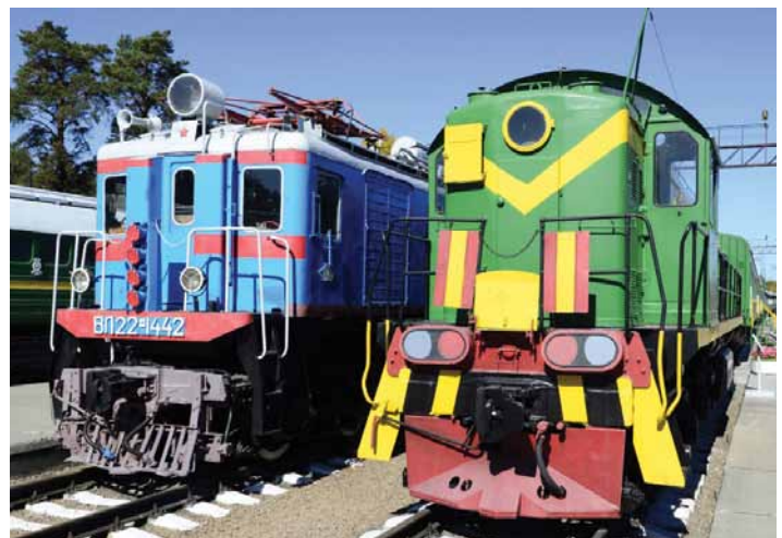
Novosibirsk Railway Museum

You could learn to cook some traditional Russian dishes with a local chef and prepare your own lunch with our Freedom of Choice option. Or you might also wish to visit a traditional Russian Dacha (summer house) to get an insight into the everyday life of an average Russian family.