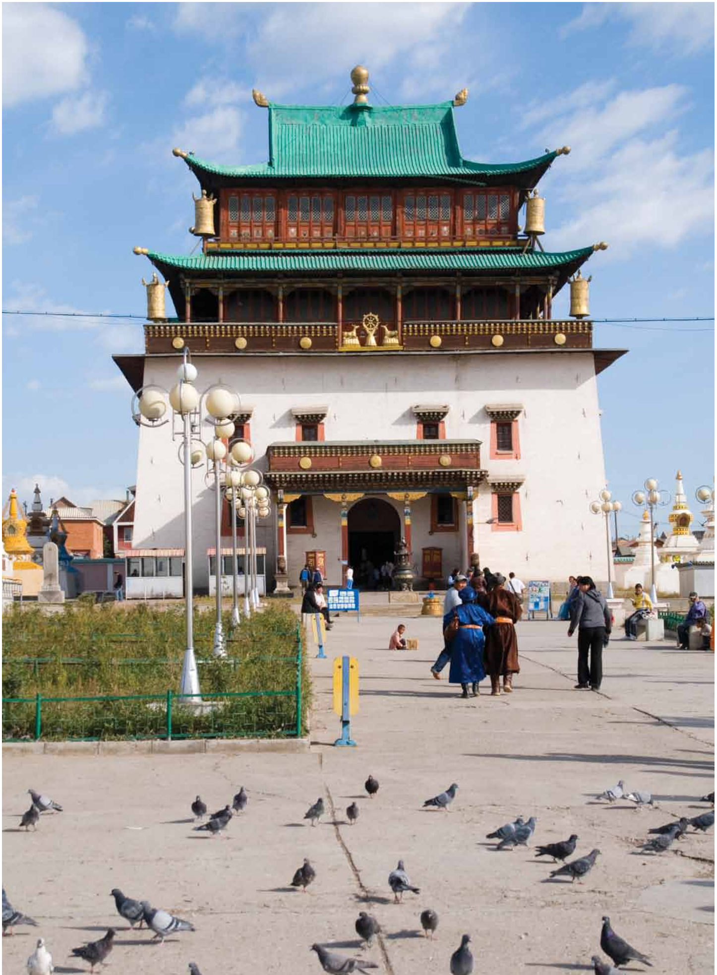
Gandan Monastery, Ulaan Baatar