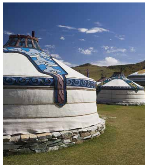
Gorkhi-Terelj National Park, Mongolia