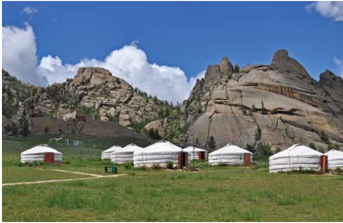
Gorkhi-Terelj National Park, Mongolia